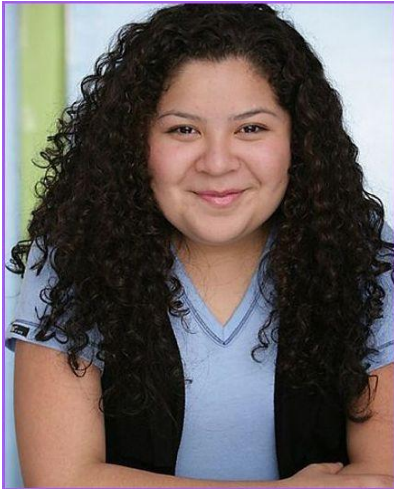
Trish from Austin and Ally