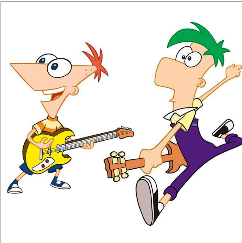
Phineas and Ferb