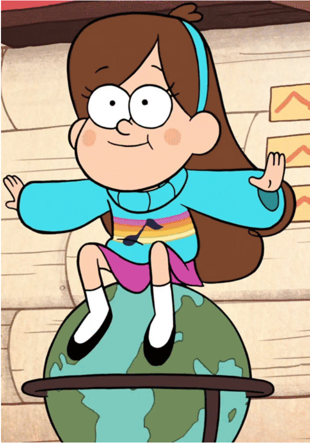
Mabel from Gravity Falls